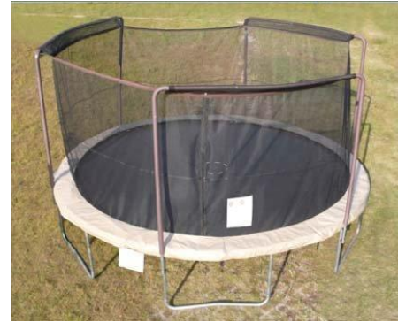
Sportspower BouncePro Trampoline

On May 17 th , 2012, Aqua-Leisure recalled First Fitness® trampolines with handlebars due to a faulty handlebar. Metal fatigue can cause the handlebar to break away during use, posing a risk of laceration from exposed metal surfaces.