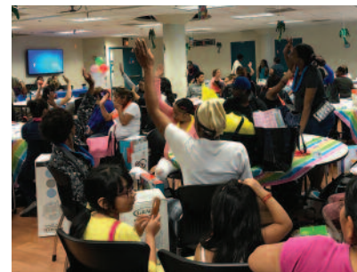
KID participates in the 2017 Sinai Community Institute Baby Shower.

Hear from our founders on this and more changes at KID in our annual report – watch for it in late October!