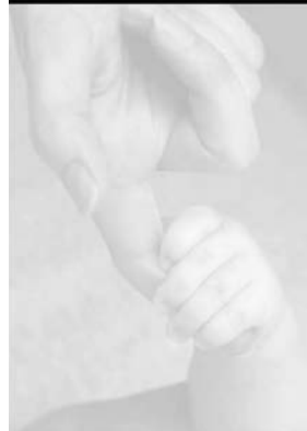
2007 Best Friend Award Night