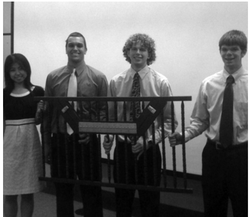
Pictured above (left to right) A University of Michigan student team demonstrates their crib design; a Northwestern University student team poses with their design